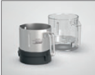
Grinding vessels 1.4 litre