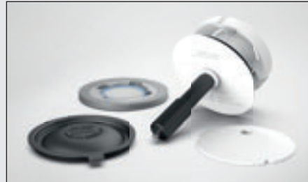
Lids for grinding vessels