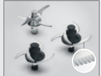
Different knives with 4 blades