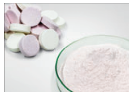
Cookies and vitamin tablets before and after comminution in the Knife Mill PULVERISETTE 11